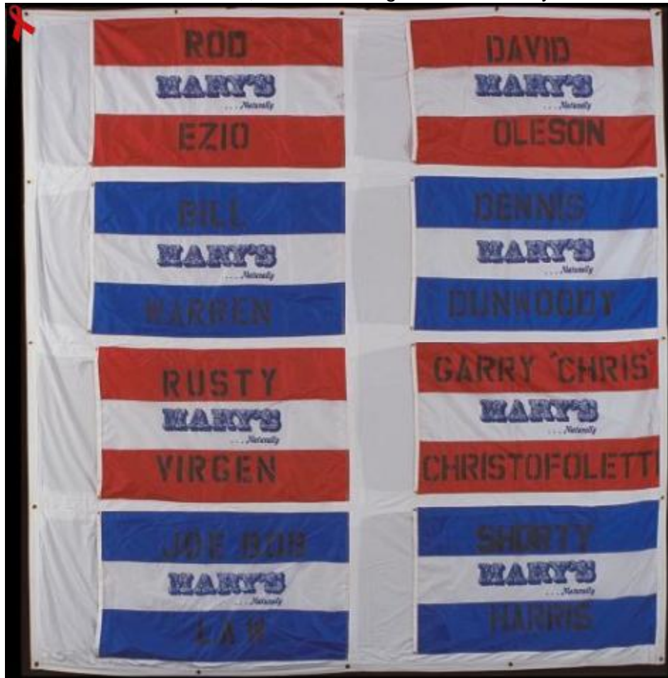
Names (panel number) on Block # 134